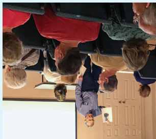
Coffee and Culture Series: History of Mexico, from Independence to Present