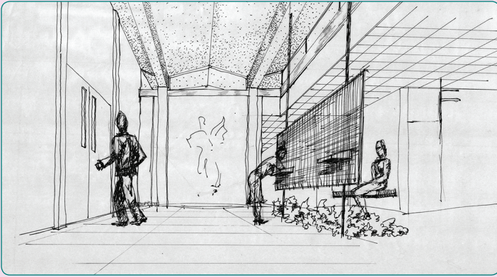
Darling-Mouser Funeral Home