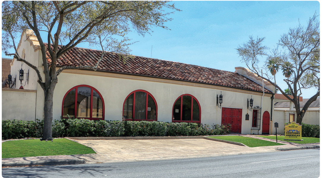
Future home of the Costumes of the Americas Museum, 1004, E. Sixth Street, Brownsville, Texas