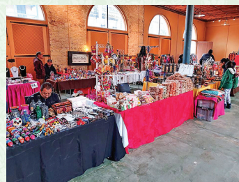
Feria Artesanal - Market Square