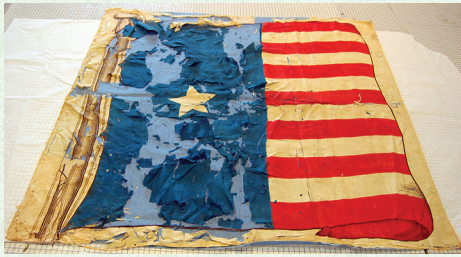
Original condition of the flag.

The BHA received the silk flag in poor condition. In its initial state, the material from the flag was malleable and not observed to be brittle. The left side of the flag containing the canton blue square with a white star, was poorly dismantled. The stripes were in a solid