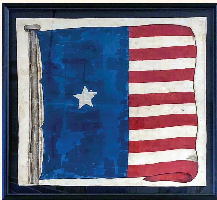
The Texas Naval Battle Flag in its current state.