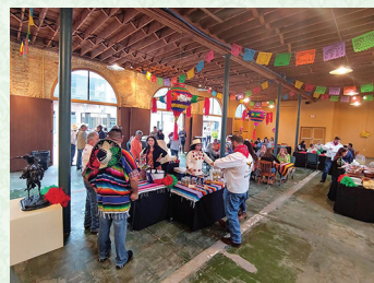
Historical Happy Hour: Viva Order of the Brush! - Market Square