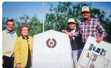
Palo Alto historical marker dedication.