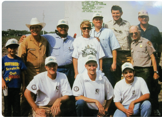
Photo from 1998 Rio Reforestation event.