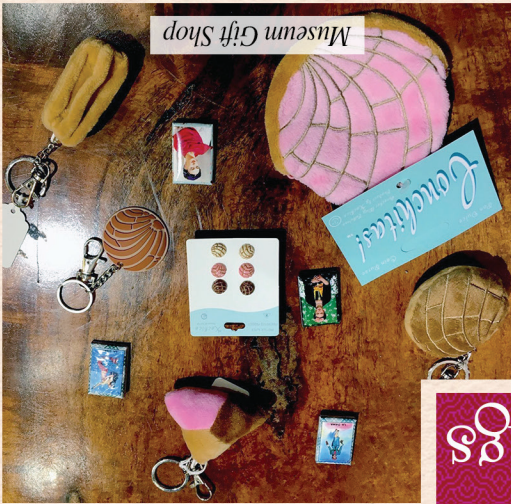
Museum Gift Shop