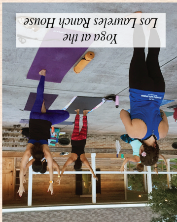
Yoga at the Los Laureles Ranch House