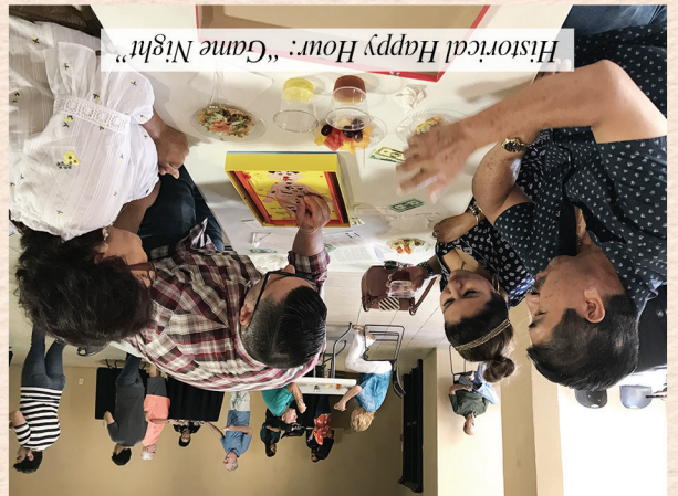
Historical Happy Hour: "Game Night"