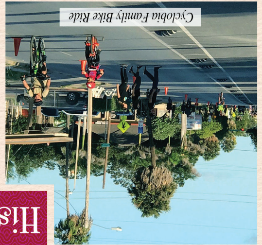
Cyclobia Family Bike Ride