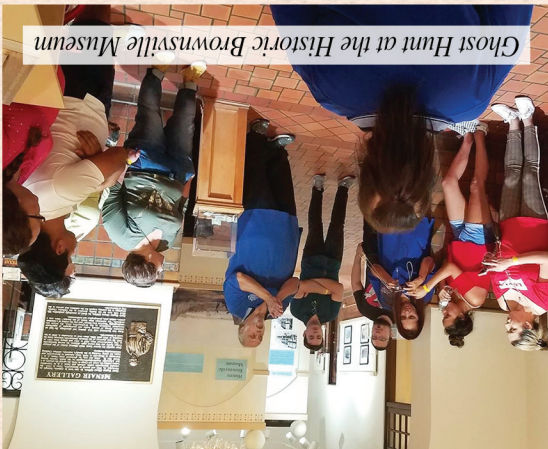
Ghost Hunt at the Historic Brownsville Museum