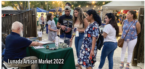
Lunada Artisan Market 2022