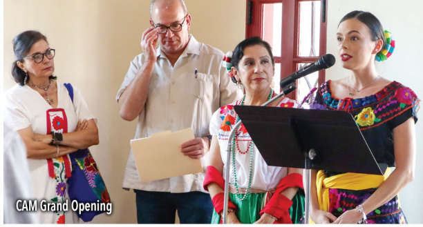
CAM Grand Opening