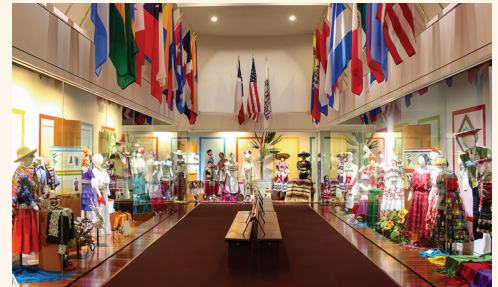
Costumes of the Americas Museum Interior 2018

for exhibit display in the museum. The museum opened its doors in 2005. Over the years, the collection has grown - the result of acquisitions and gifts from those belonging to PART I and local Brownsville PART II members, from private collections, from friends of the Table, and bequests. After many successful years in Dean Porter Park, the CAM came to an agreement with the Children's Museum of Brownsville, who desperately needed space for expansion, to move the collection and its museum to a new location. As a result, in 2021, the Costumes of the Americas Museum reached a merger agreement with the Brownsville Historical Association. From June 2021 to August 2022, the BHA began an estimated $200,000 renovation of the Old City Cemetery Center for the relocation. The project consisted of roof repairs, window replacements, HVAC upgrades, and landscaping improvements. On September 11, 2022, the museum opened its doors once again to the public at its new location.