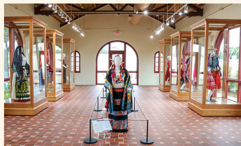
Costumes of the Americas Museum Interior 2022