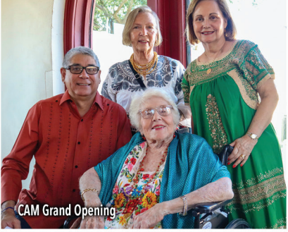
CAM Grand Opening