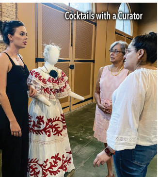
Cocktails with a Curator