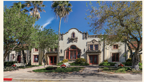
Historic Brownsville Museum Facade 2022