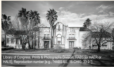
Southern Pacific Railroad Depot Facade 1979