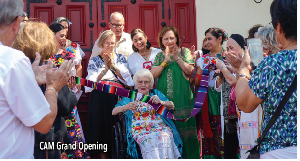
CAM Grand Opening