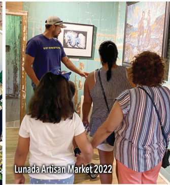
Lunada Artisan Market 2022