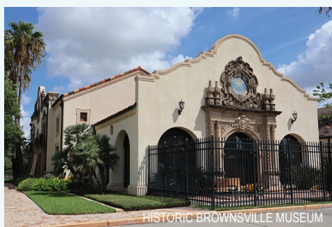
HISTORIC BROWNSVILLE MUSEUM

museum at its new location and we are delighted to see visitors learn more about the priceless collection of textiles and costumes collected for decades by Brownsville women. Come visit the new museum soon!