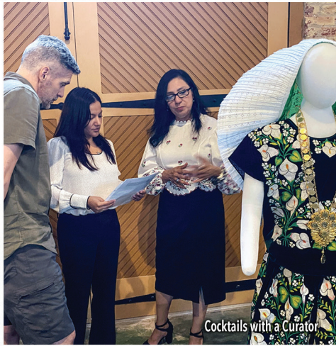
Cocktails with a Curator