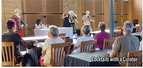
Cocktails with a Curator

CAM Grand Opening Lunada Artisan Market 2022 Cocktails with a Curator