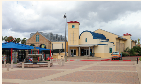
Costumes of the Americas Museum Exterior 2005