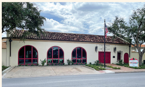
Costumes of the Americas Museum Facade 2022

for exhibit display in the museum. The museum opened its doors in 2005. Over the years, the collection has grown - the result of acquisitions and gifts from those belonging to PART I and local Brownsville PART II members, from private collections, from friends of the Table, and bequests. After many successful years in Dean Porter Park, the CAM came to an agreement with the Children's Museum of Brownsville, who desperately needed space for expansion, to move the collection and its museum to a new location. As a result, in 2021, the Costumes of the Americas Museum reached a merger agreement with the Brownsville Historical Association. From June 2021 to August 2022, the BHA began an estimated $200,000 renovation of the Old City Cemetery Center for the relocation. The project consisted of roof repairs, window replacements, HVAC upgrades, and landscaping improvements. On September 11, 2022, the museum opened its doors once again to the public at its new location.