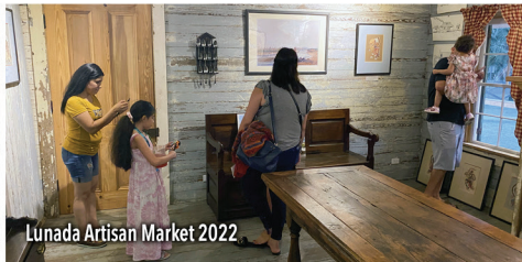
Lunada Artisan Market 2022