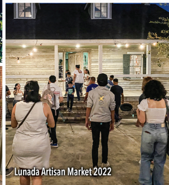
Lunada Artisan Market 2022

Non-Profit Org. U.S. Postage PAID Permit No. 47 Brownsville, TX