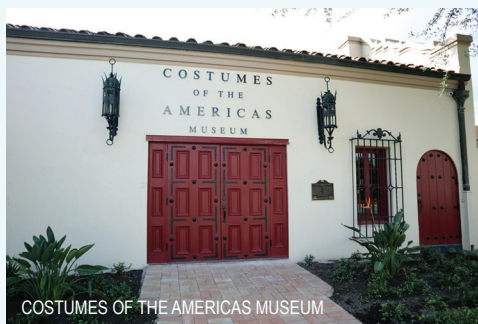
COSTUMES OF THE AMERICAS MUSEUM

We cannot deny that we have plenty of work ahead of us with limited staff and funding. Nevertheless, we are optimistic that the next 75 years will be just as remarkable as the last. Thanks to membership support and donor contributions we are able to continue our all-important mission of preserving and protecting our local history; we truly appreciate your participation over the years.