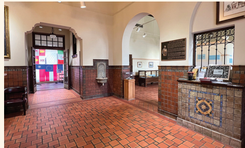
Historic Brownsville Museum Interior 2022