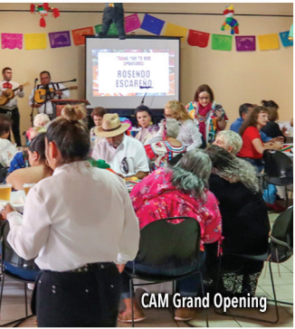
CAM Grand Opening