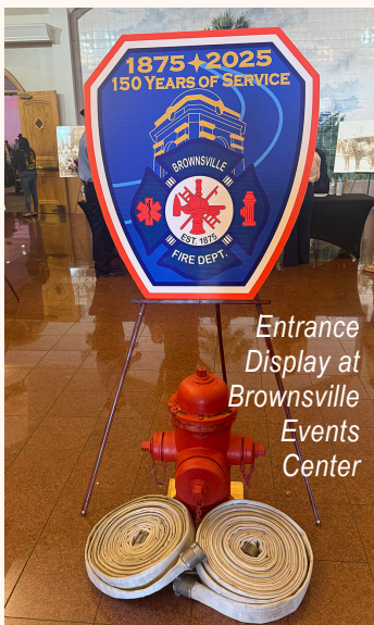
Entrance Display at Brownsville Events Center

individuals who have shaped the department's growth, reflect on a century and a half of dedicated service, and honor the lives lost in service to the community. In addition to the ceremonies and presentations, attendees explored a temporary exhibit of artifacts and memorabilia curated by the Fire Department with support from the BHA's archives and collections. The exhibit featured materials such as: 1940s ledgers, early pull-style fire stations, historic helmets, and various fire extinguishers-