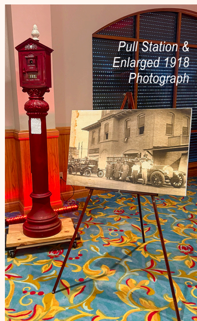
Pull Station & Enlarged 1918 Photograph