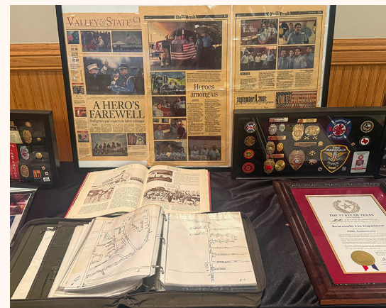
Newspaper Clippings, Badges, Patches, and other memorabilia