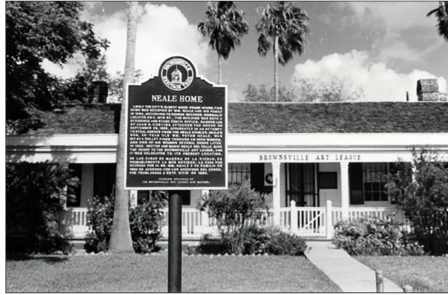
Neale House Photograph #1, photograph, Date Unknown

stewardship, and continued community support, the Brownsville Historical Association is preserving the city's unique architectural heritage while creating vibrant spaces that inspire learning, cultural engagement, and civic pride. As these efforts move forward, they reinforce Brownsville's identity as one of Texas' most historically significant communities and demonstrate that historic preservation is an ongoing commitment that benefits generations to come.