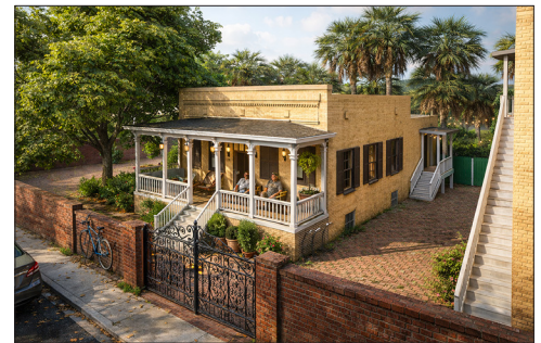
Rendering of the 1877 Building.